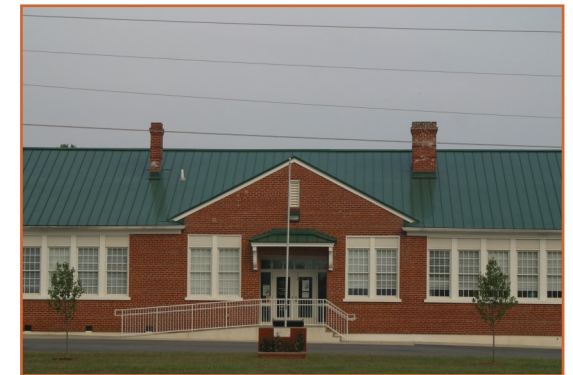
Russell Grove High School 1933-1969 Home of the Falcons