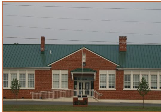
Russell Grove High School 1933-1969 Home of the Falcons