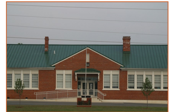
Russell Grove High School 1933-1969 Home of the Falcons