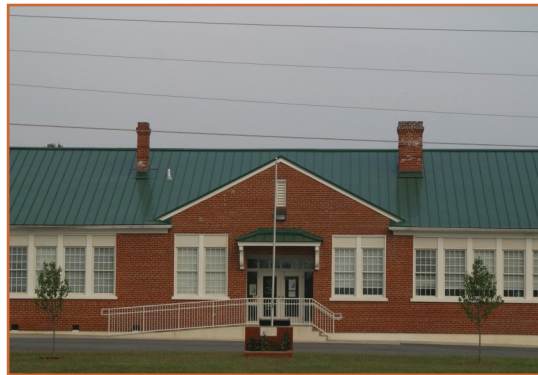
Russell Grove High School 1933-1969 Home of the Falcons