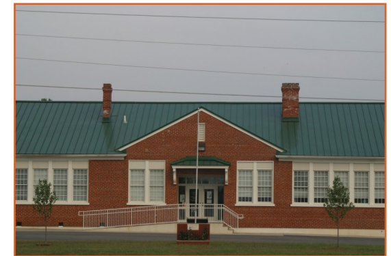
Russell Grove High School 1933-1969 Home of the Falcons